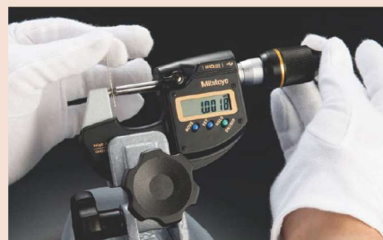
Recommended micrometer stand: 156-101-10